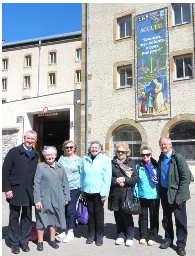
The group at Notre Dame de La Salette

On the fifth day, we travelled to Grenoble and celebrated the Eucharist at the chapelle de l'Adoration at Rue Voltaire, the same place where Fr Eymard presided his last Mass. When visiting the Cathedral of Grenoble, we saw two statues very near the altar, that of the Holy Curé of Ars and that of St Peter Julian Eymard. The two were both ordained in Grenoble: Jean Marie Vianney on Sunday, August 13, 1815 and Fr Eymard on Sunday July 20 th , 1834. After lunch, we went to visit the Grande Chartreuse . This was a delightful trip with absolutely beautiful scenery that truly delighted us, pilgrims. At the museum of La Correrie, we got some understanding of the life of St Bruno and his companions, the evolution of the Carthusian Order and of what a day in the life of a Carthusian monk entailed. We returned to La Mure with lovely memories, images, stories and insights to reflect on.